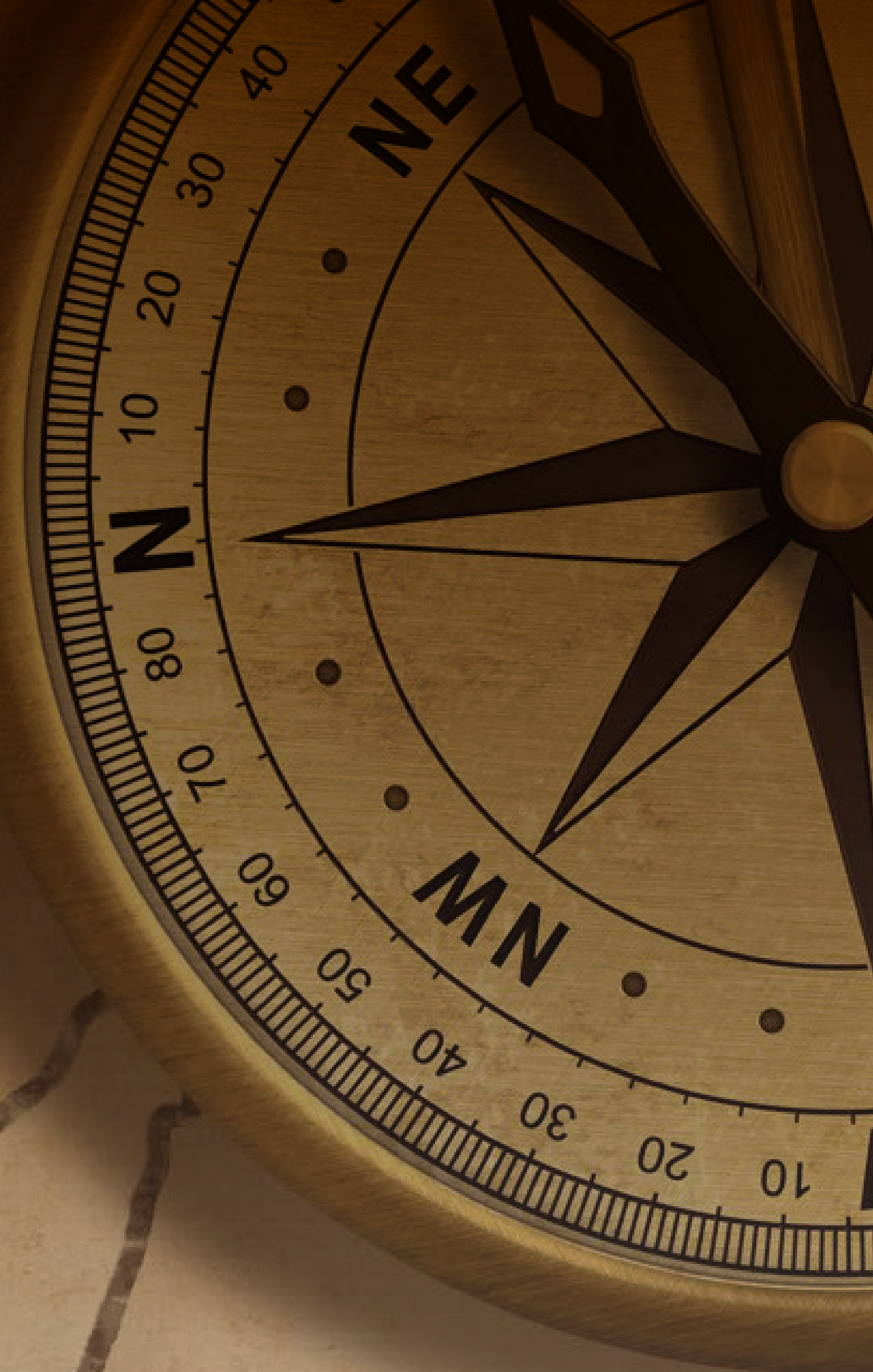
CHART YOUR COURSE